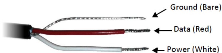
Figure 2: Pigtail End Wiring

Customers may purchase GS1 sensors for use with non-Decagon data loggers. These sensors typically come configured with stripped and tinned (pigtail) lead wires for use with screw terminals. Refer to your distinct logger manual for details on wiring.